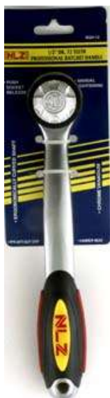
Style : RGH-12