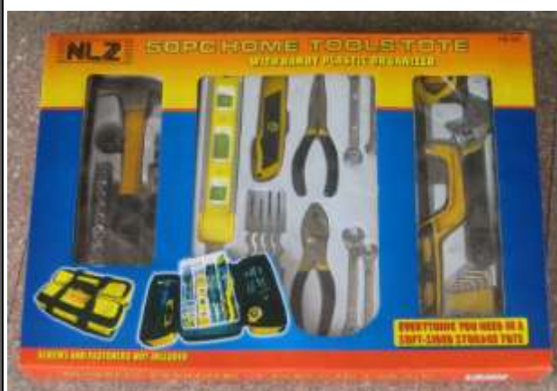
Style : TB-50