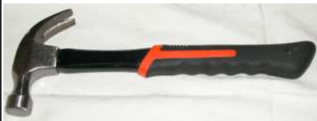
Style : BD-12