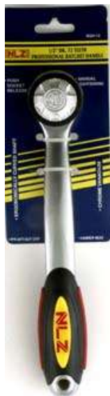
Style : RGH-12