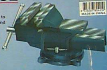
Style : 1132