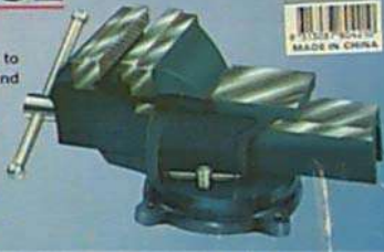
Style : 1132