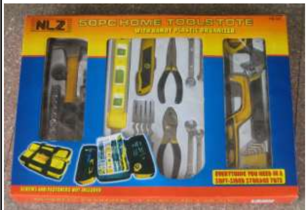
Style : TB-50