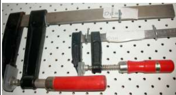
Style : D-1209