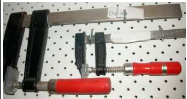
Style : D-1209